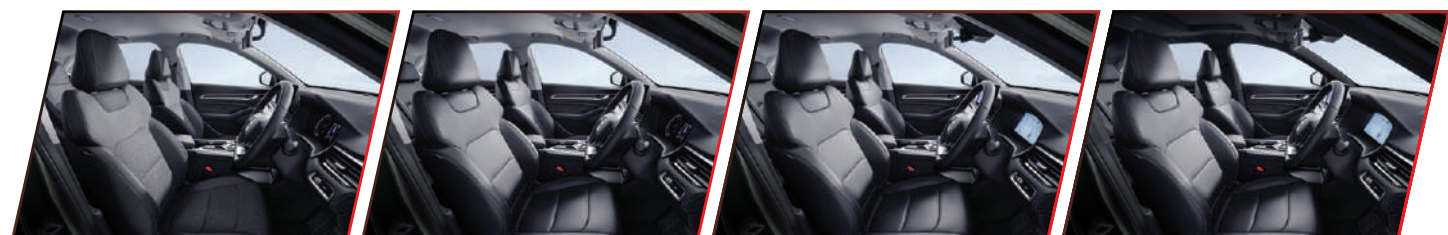
1.5TD Executive Fabric Seats 1.5TD Premium Leatherette Seats 1.5TD Flagship Leatherette Seats 1.5TD Flagship X Leatherette Seats

RUBY RED QUARTZ BLACK SPACE GREY SNOW WHITE MARINE BLUE ARMOUR SILVER